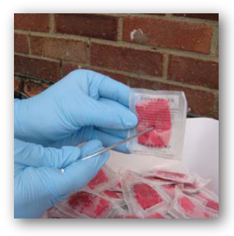
Step 1 Pierce bait with rod or wire.

Brigand SB (soft bait) can be easily secured inside all bait stations, reducing the risk of removal by rodents.