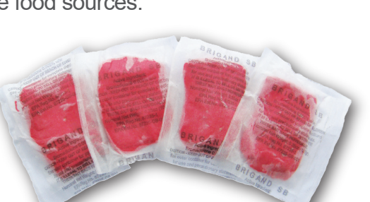
Brigand SB Packets

Brigand soft bait is extremely palatable to both rats and mice and ideal for use in all situations, but especially those where rodents must be tempted away from other available food sources.