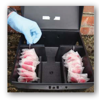
Step 3 Place in bait station in secure location.