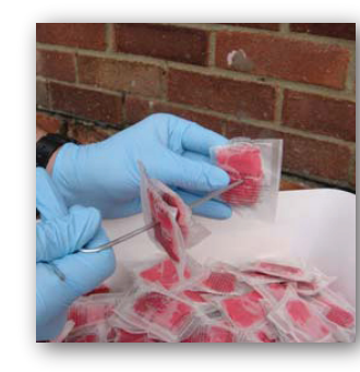
Step 2 Load rod with desired weight three packets equal 1oz.